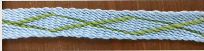
Intertwining on Interlacing