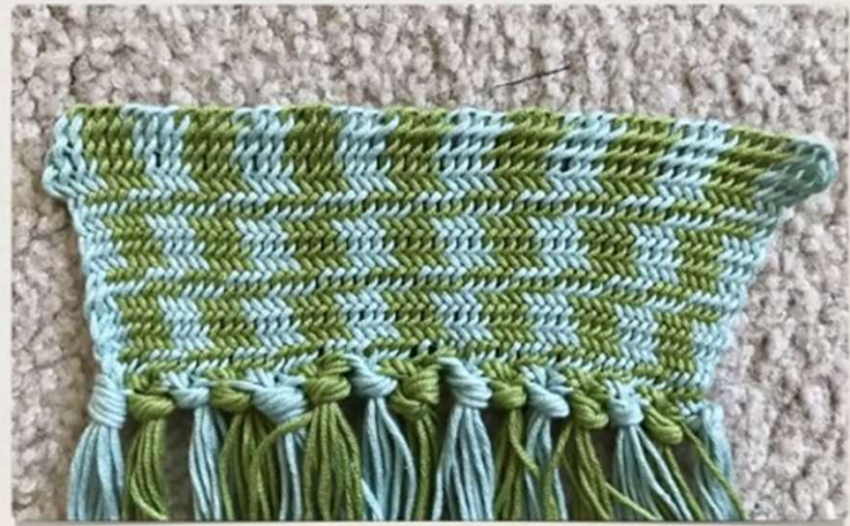
Color & Weave in S & Z