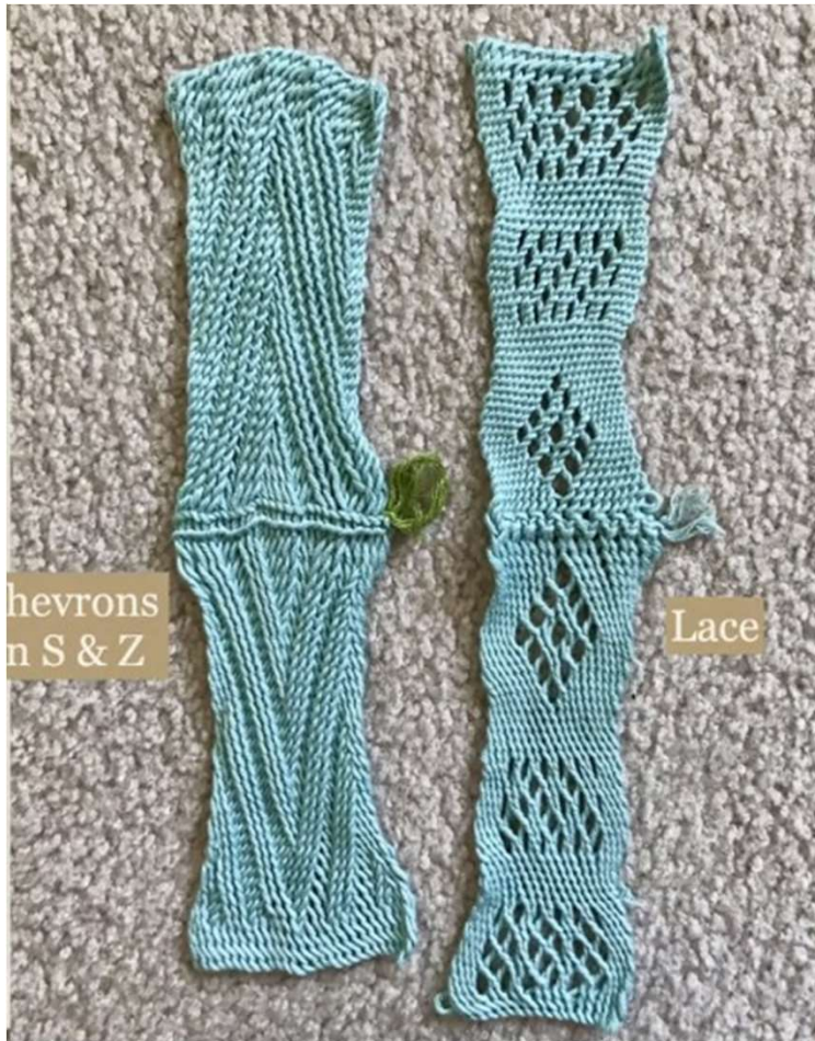
chevrons in S & Z